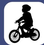
Indoor & Outdoor Sports